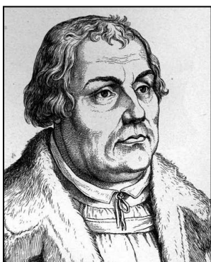
Martin Luther 1483-1546

Unless I am convinced by the testimony of the Scriptures or by clear reason, I am bound by the Scriptures I have quoted and my conscience is captive to the Word of God. I cannot and will not recant anything, since it is neither safe nor right to go against conscience. May God help me. Amen.