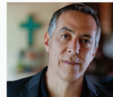
FERNANDO ORTEGA FERNANDOORTEGA.COM