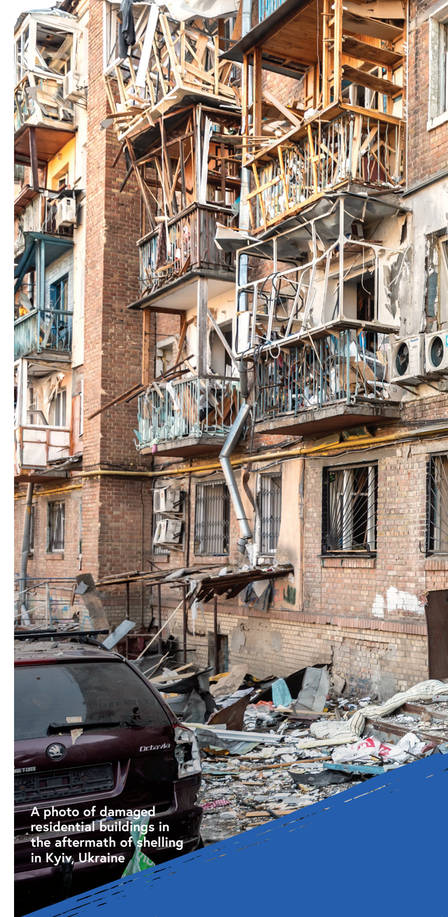
A photo of damaged residential buildings in the aftermath of shelling in Kyiv, Ukraine

Learn more at | pcpc.org/crates-for-ukraine