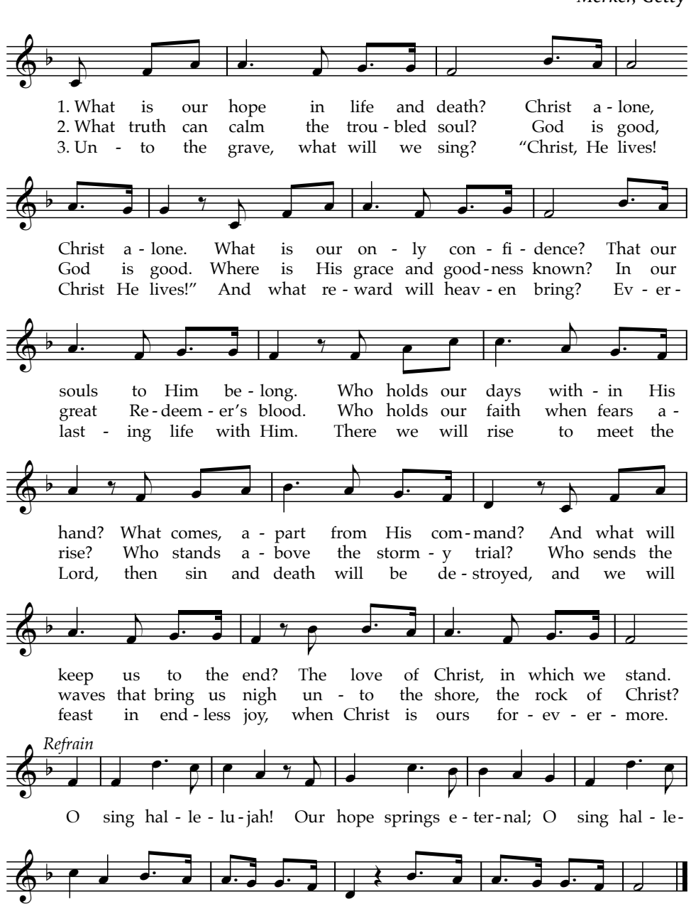
lu-jah! Now and ev-er we con-fess Christ our hope in life and death.