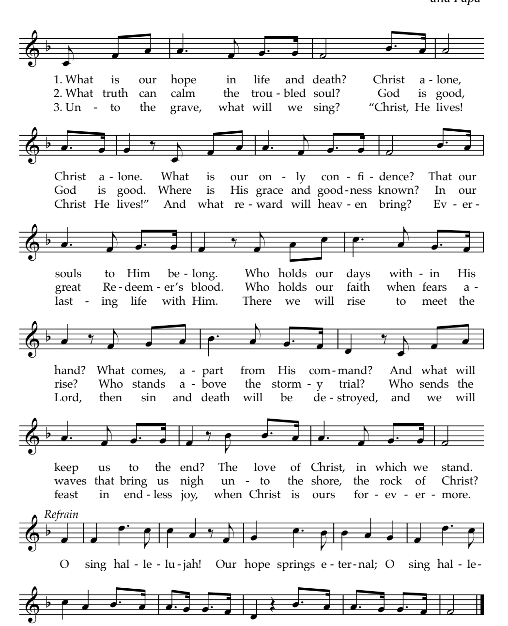
lu-jah! Now and ev-er we con-fess Christ our hope in life and death.