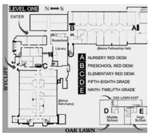
A nursing mothers' room with livestream of the worship service is on the lower level beneath the Narthex.