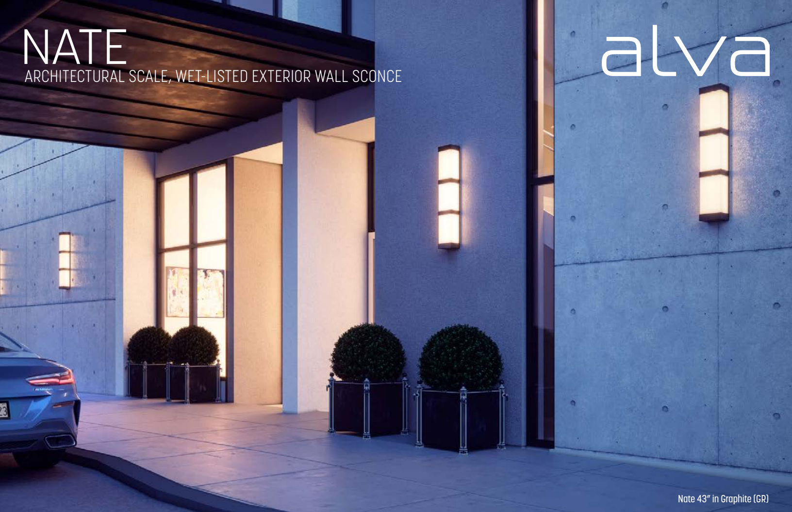
Nate 43" in Graphite (GR)