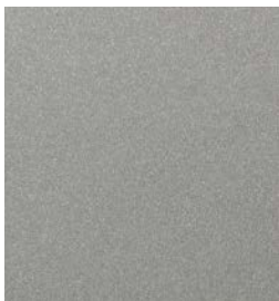
ESN - Enviro Satin Nickel