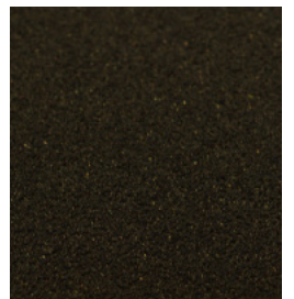
DB - Dark Bronze

Custom RAL colors supplied on special order