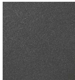
GR - Graphite