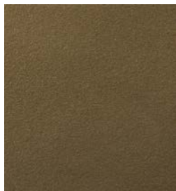
EOB - Enviro Oil-Rubbed Bronze