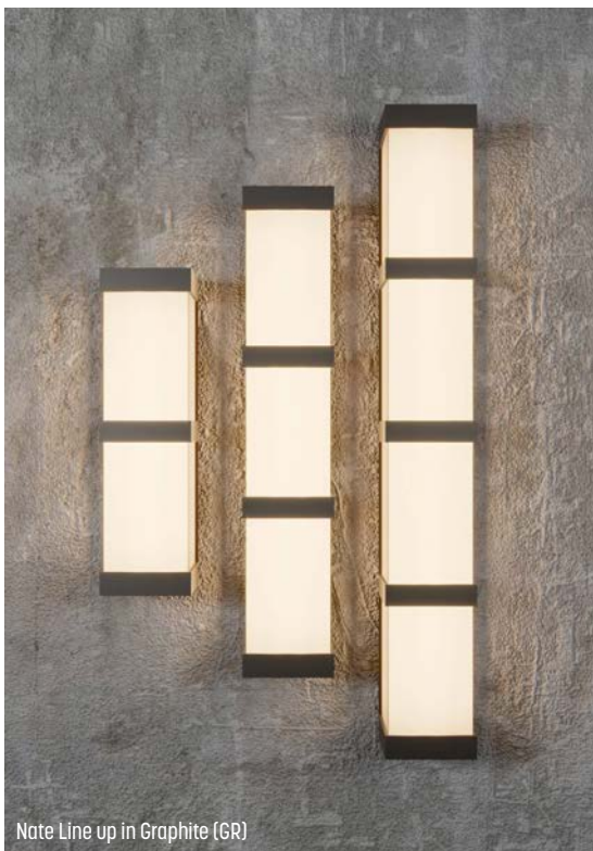
Nate Line up in Graphite (GR)