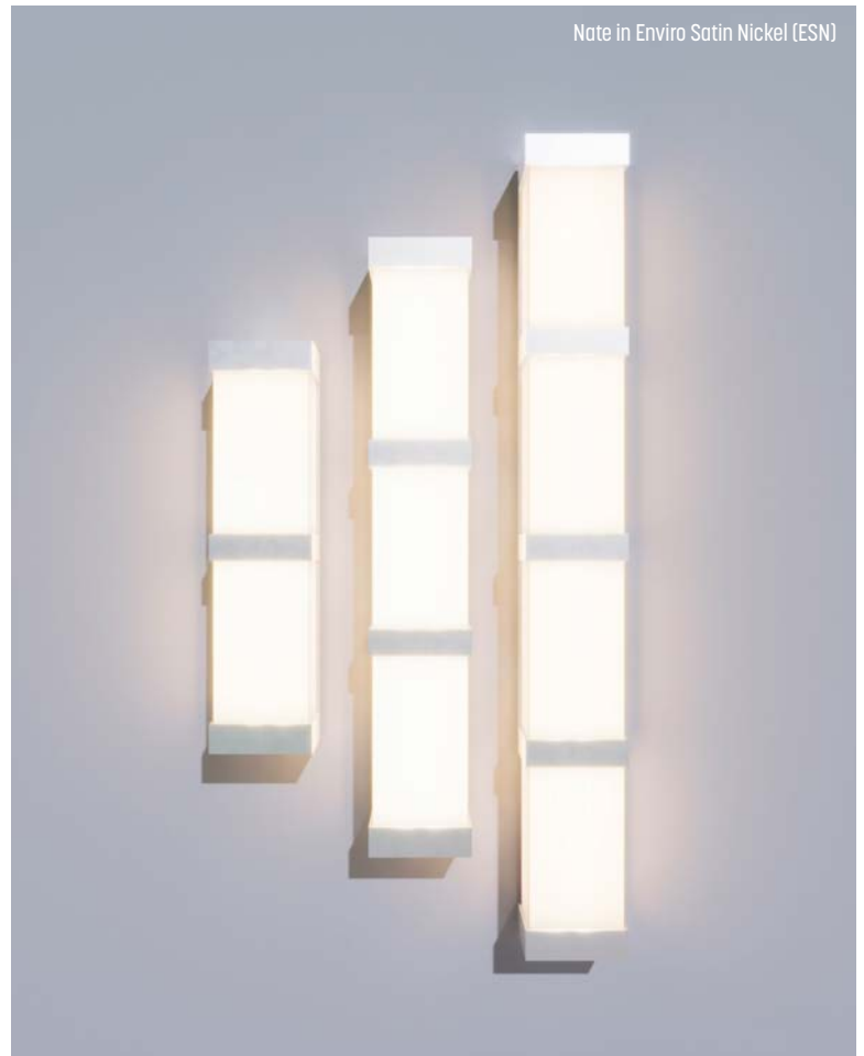
Nate in Enviro Satin Nickel (ESN)

Maximum Candela = 232.79 Located At Horizontal Angle = 0, Vertical Angle = 120 # 1 - Vertical Plane Through Horizontal Angles (0 - 180) (Through Max. Cd.) # 2 - Horizontal Cone Through Vertical Angle (120) (Through Max. Cd.)