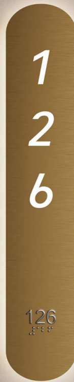
Satin Brass Finish