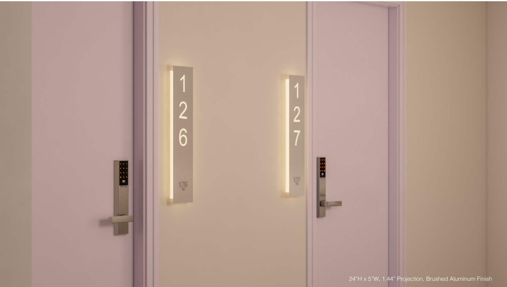
24" H x 5" W, 1.44" Projection, Brushed Aluminum Finish