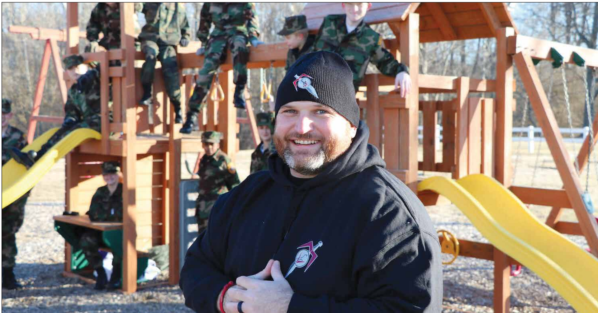
RED RIBBON CAMPAIGN