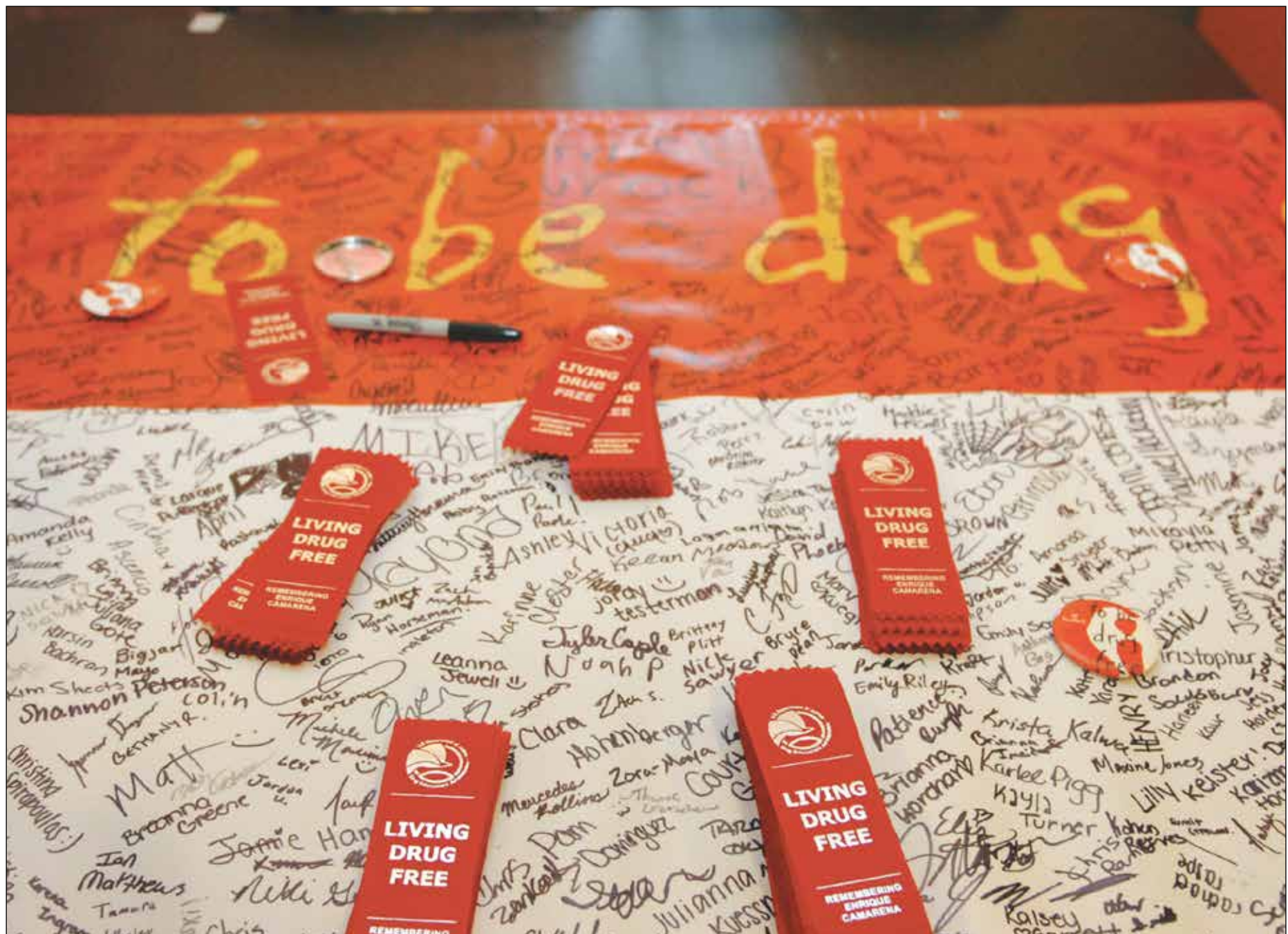
MARYLAND NATIONAL GUARD

Red Ribbon Week is a prime opportunity for communities to take a stand against drugs. National Family Partnership sponsors the week of celebration and sells items related to each year's theme. Proceeds from the sale of this merchandise helps support prevention programs across America. Available merchandise includes banners, posters, hand sanitizers, sunglasses, face masks and more.