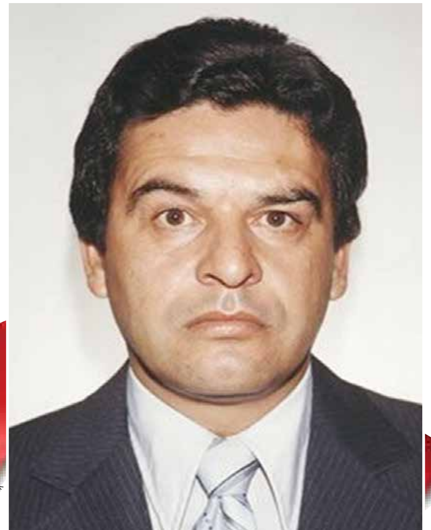
UNITED STATES DRUG ENFORCEMENT ADMINISTRATION