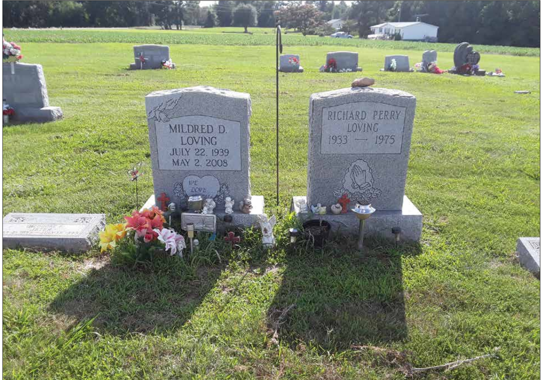
The graves of Mildred and Richard Loving in Central Point, Virginia.

In November of 1963, the Lovings began a legal battle that would go all the way to the Supreme Court. They filed a motion with the original