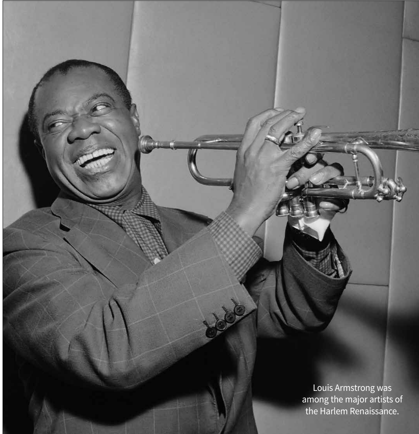
Louis Armstrong was among the major artists of the Harlem Renaissance.