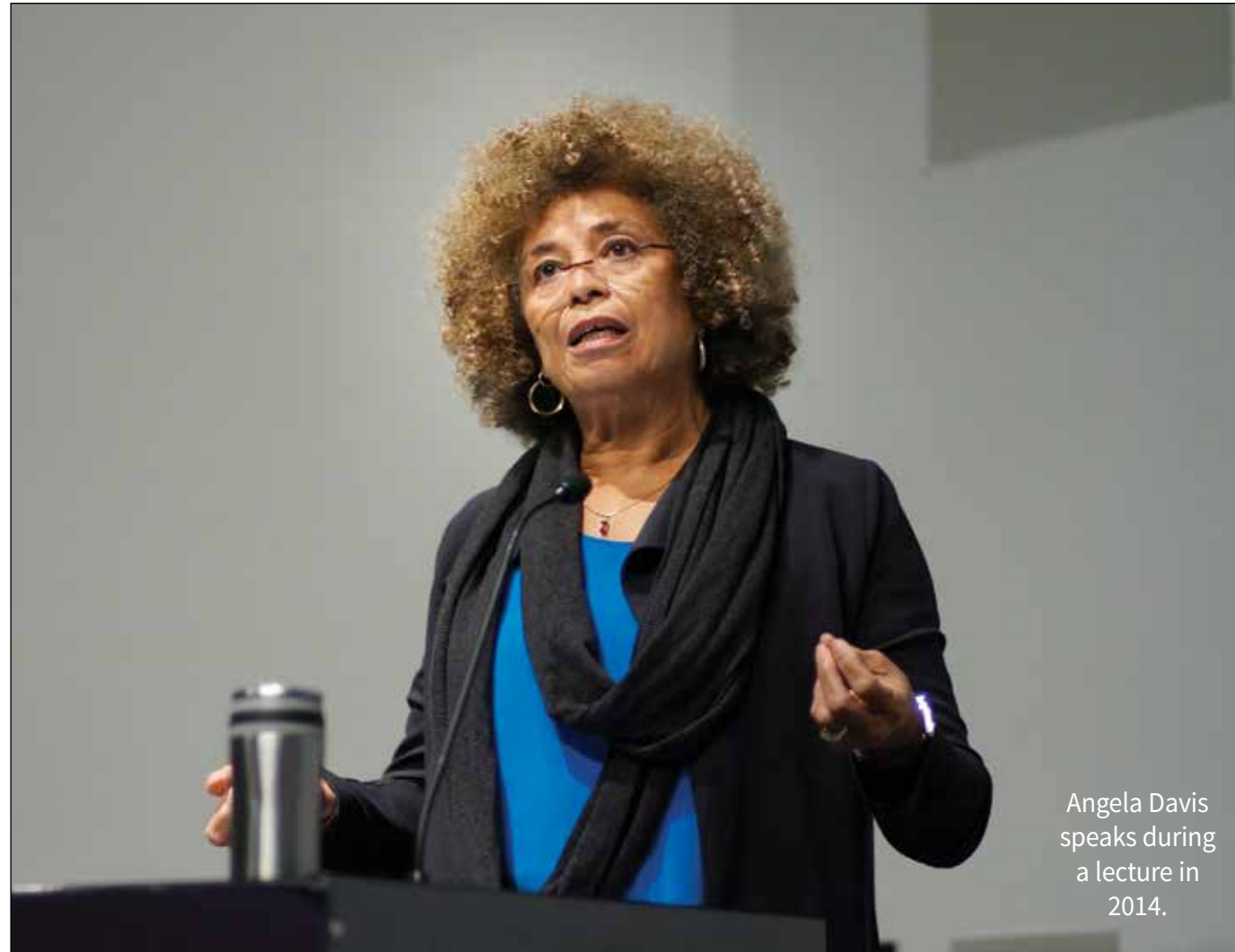
Angela Davis speaks during a lecture in 2014.

After moving to the United States in 1914, he founded several businesses, including the Negro Factories Corporation