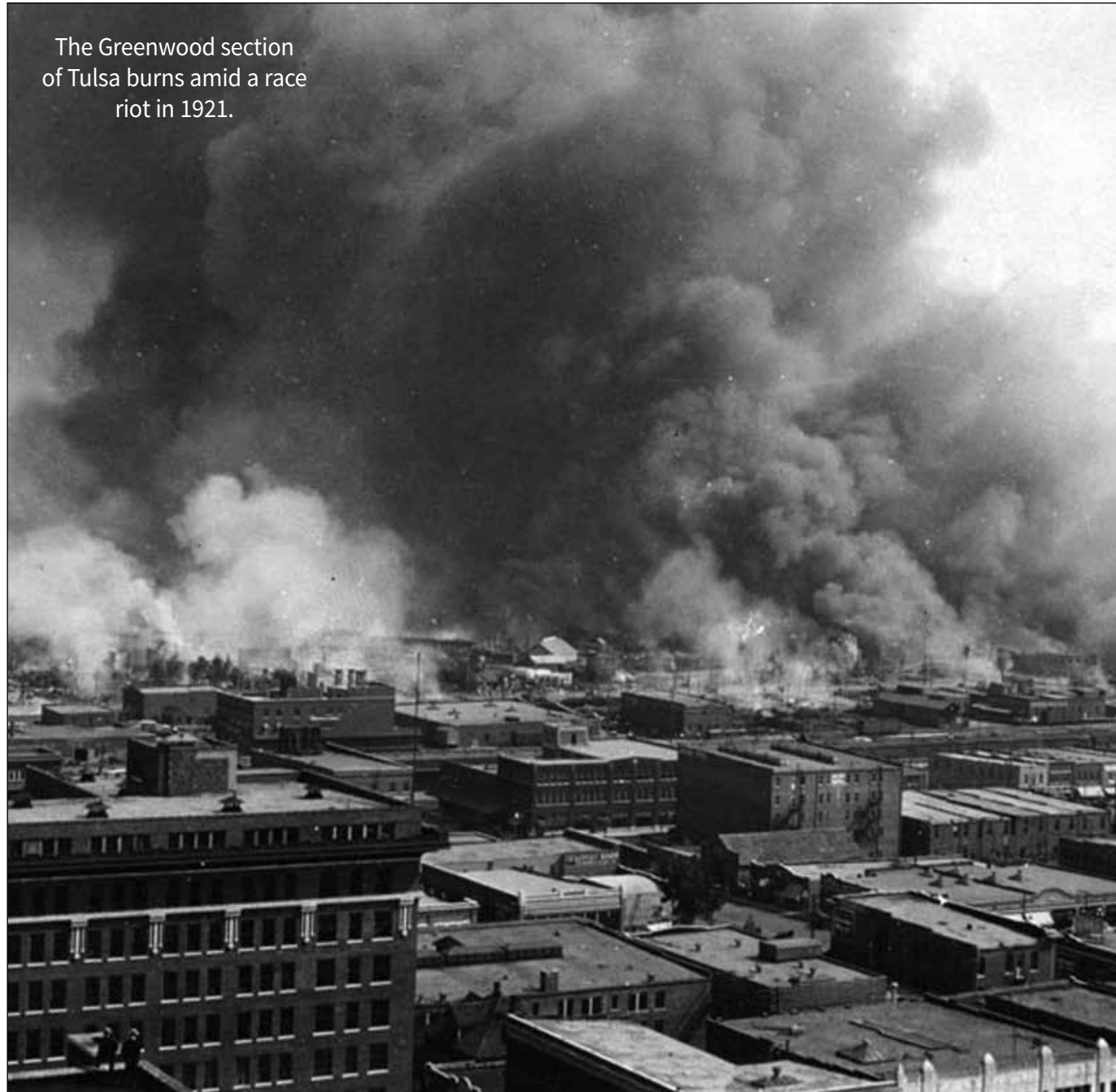
The Greenwood section of Tulsa burns amid a race riot in 1921.

The town, called Greenwood, grew from a population of 18,182 in 1910 to more than 90,000 by 1920. Oklahoma became the home to Black millionaires and many others who amassed great wealth. Greenwood was filled with a superior school