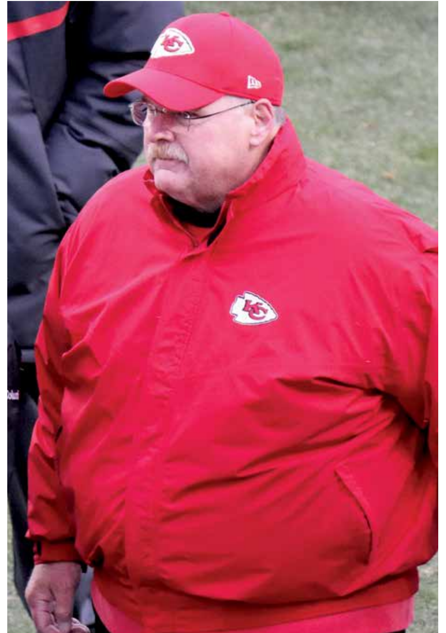
JEFFREY BEALL/CREATIVE COMMONS