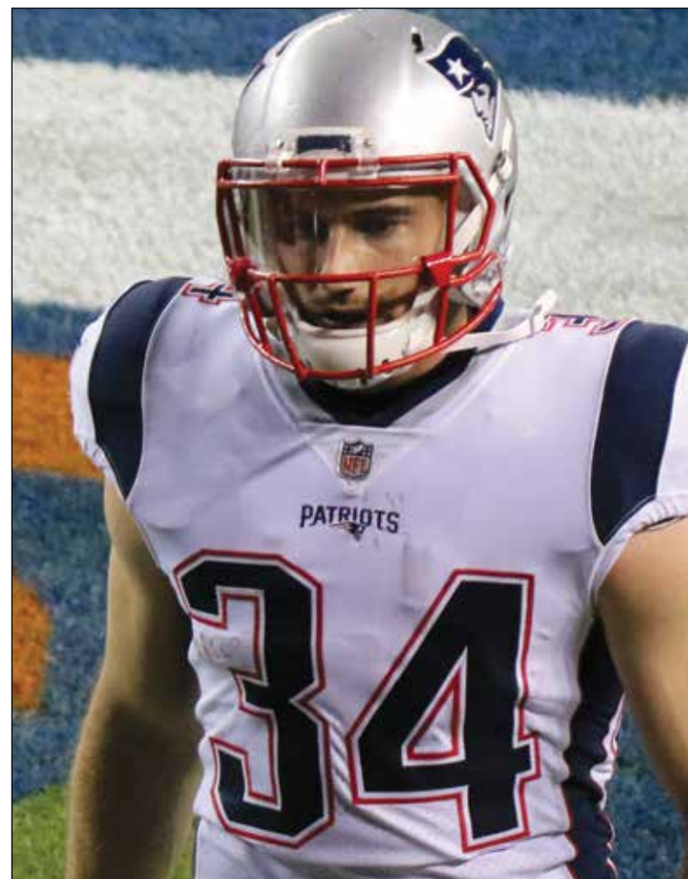
Rex Burkhead