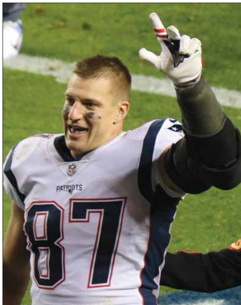
Rob Gronkowski