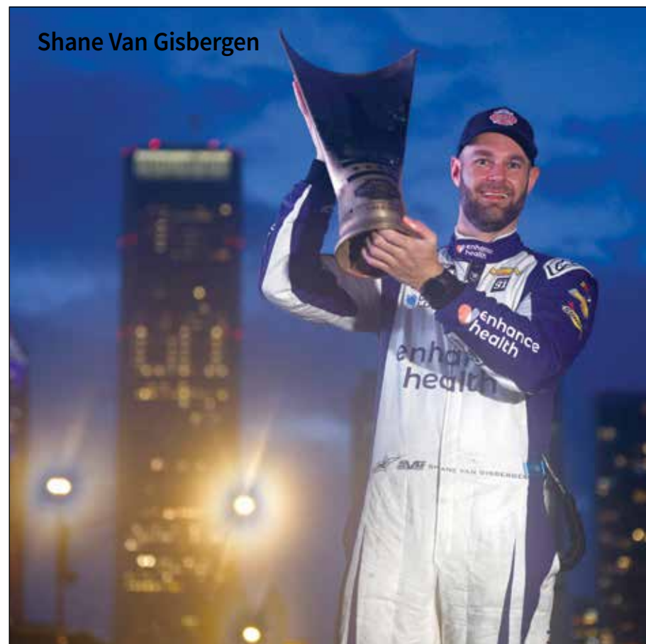
Shane Van Gisbergen

New Zealander Shane van Gisbergen made a huge Cup Series splash by winning the inaugural Chicago Street Race in 2023. He'll make at least seven Cup Series starts, while also taking on a full Xfinity schedule with Kaulig/Trackhouse Racing.