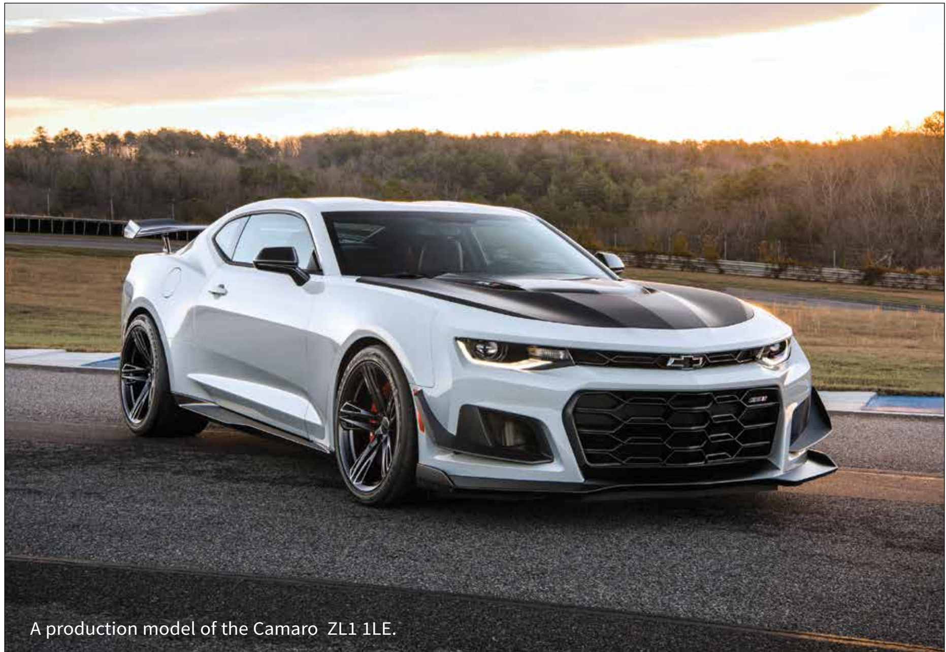
A production model of the Camaro ZL1 1LE.

The ZL1 Camaro certainly made its presence known on the NASCAR circuit. It first impressed viewers by immediately winning pole position prior to the season-opening Daytona 500. A week later, during the actual race, Austin Dillon piloted the road