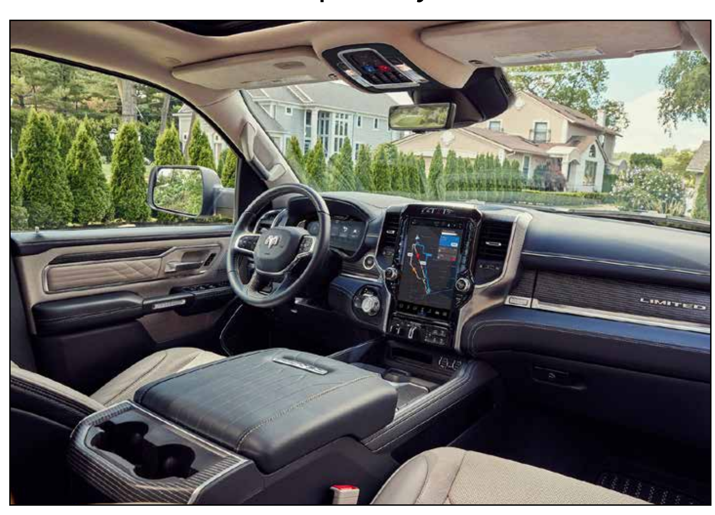
Inside the Ram 1500 Limited, luxury meets functionality with plush seating and cutting-edge technology.

The technological prowess of the Ram 1500 Limited is equally impressive. The Uconnect system offers advanced features such as split-screen capability and comprehensive 360-degree camera views, ensuring that connectivity and control are always within reach. Whether it's for entertainment or navigation, the system is designed to meet the demands of