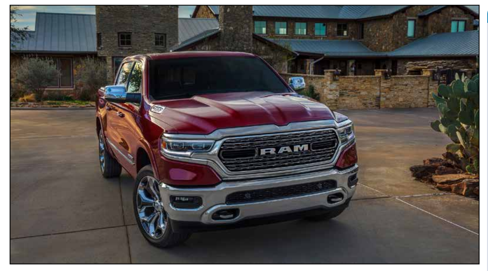
The 2024 Ram 1500 Limited exudes sophistication with its robust design and advanced features.

The technological prowess of the Ram 1500 Limited is equally impressive. The Uconnect system offers advanced features such as split-screen capability and comprehensive 360-degree camera views, ensuring that connectivity and control are always within reach. Whether it's for entertainment or navigation, the sys-