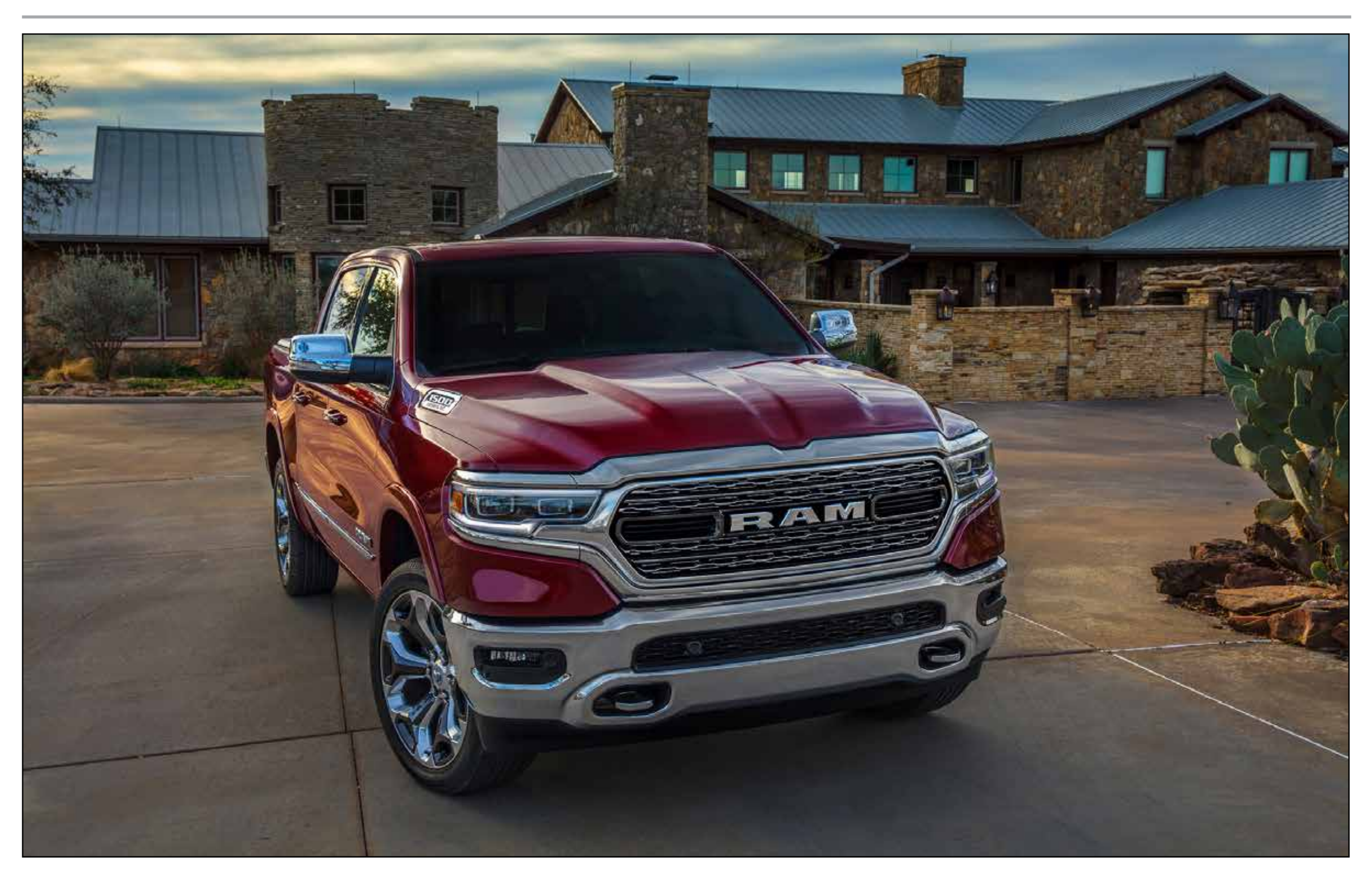
The 2024 Ram 1500 Limited exudes sophistication with its robust design and advanced features.