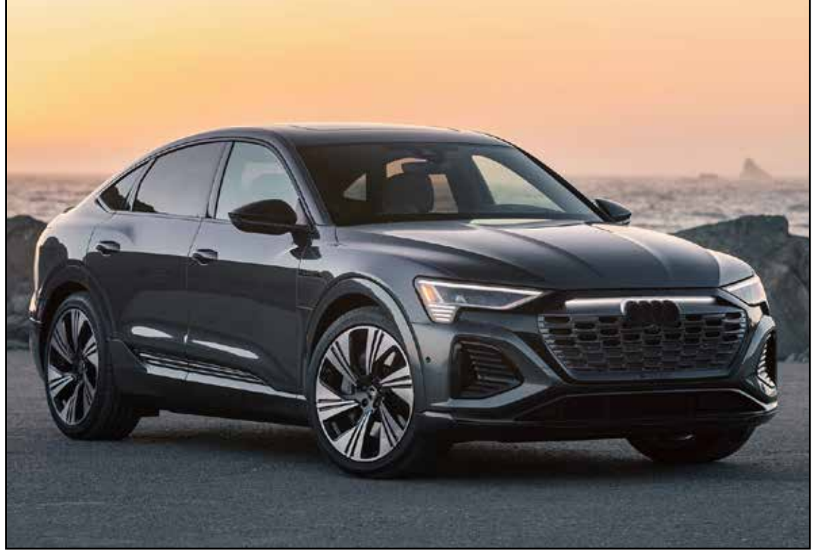
The 2024 Audi Q8 e-tron showcases Audi's new minimalist two-dimensional logo and the innovative Singleframe projection light grille.

However, no vehicle is without its drawbacks. One of the key challenges for the Q8 e-tron is its price. The model tested, with added features, comes in at a steep