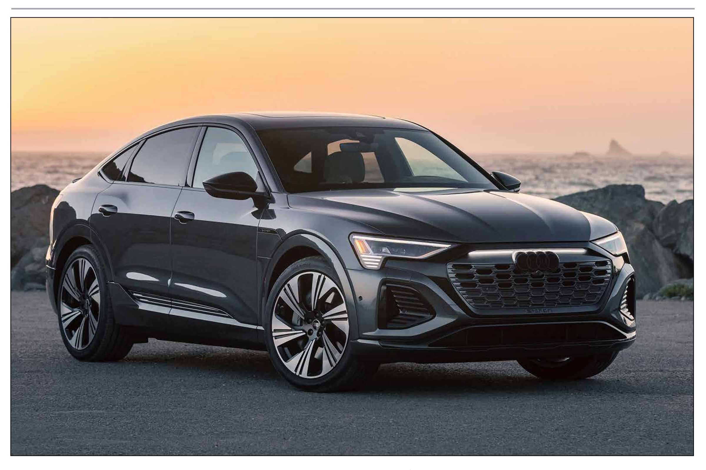
The 2024 Audi Q8 e-tron showcases Audi's new minimalist two-dimensional logo and the innovative Singleframe projection light grille.