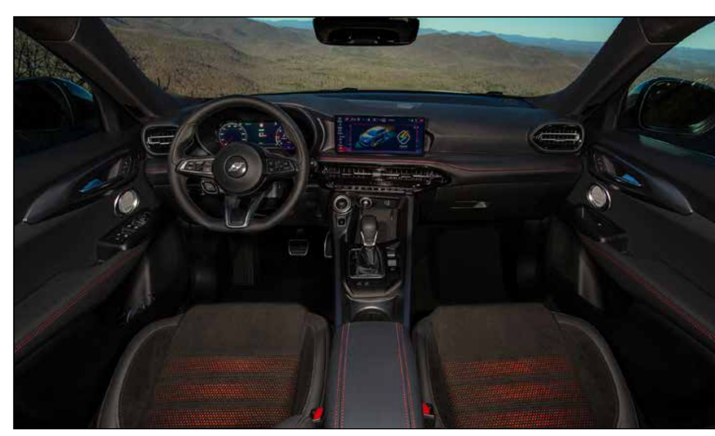
The Hornet, Dodge's most affordable current model, has a cabin that centers around the driver.

Yes, you heard that right. The Hornet emerges from the boot-