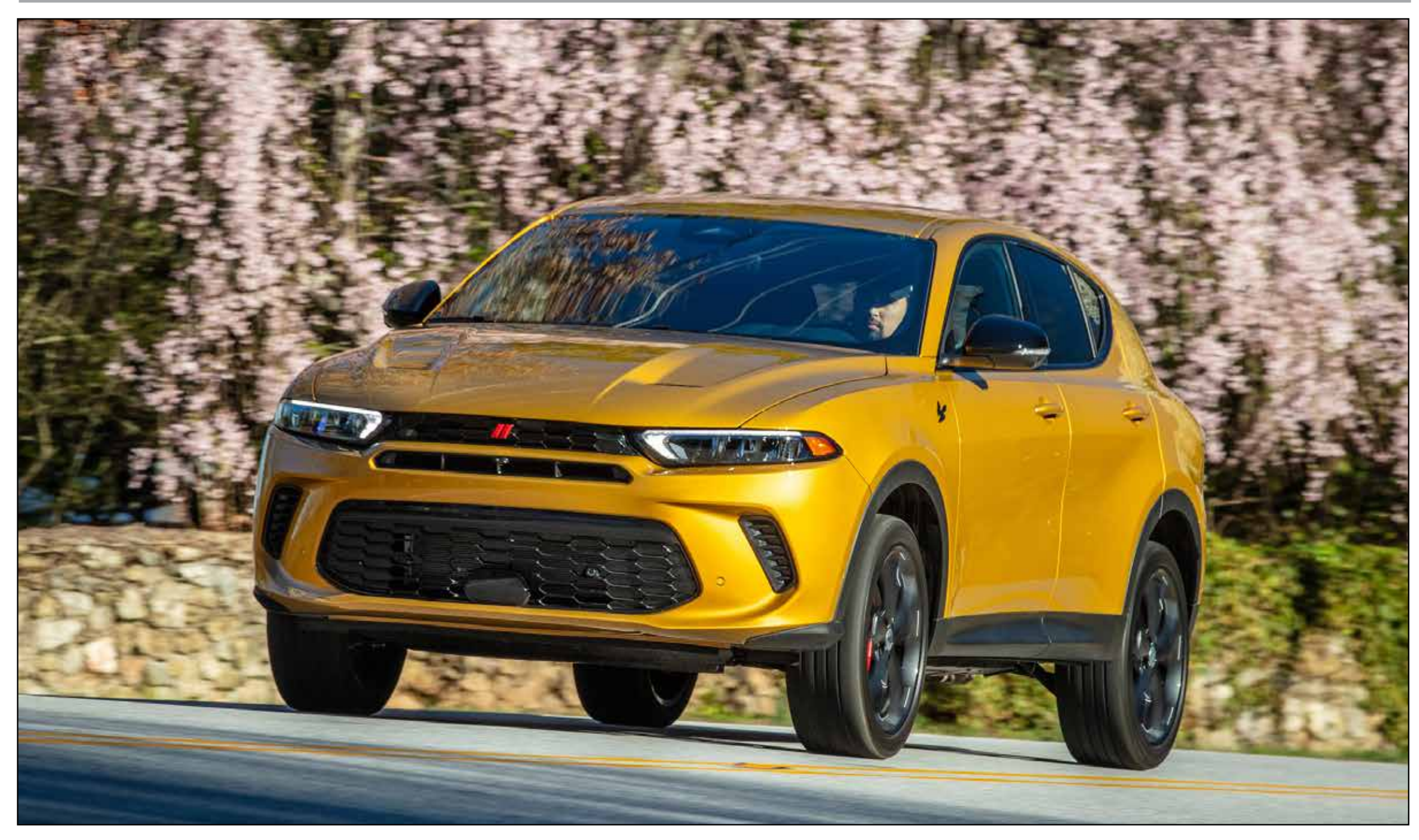
With a starting price under $30,000, the 2023 Dodge Hornet comes with a powerful turbocharged engine and styling elements inspired by classic muscle cars.