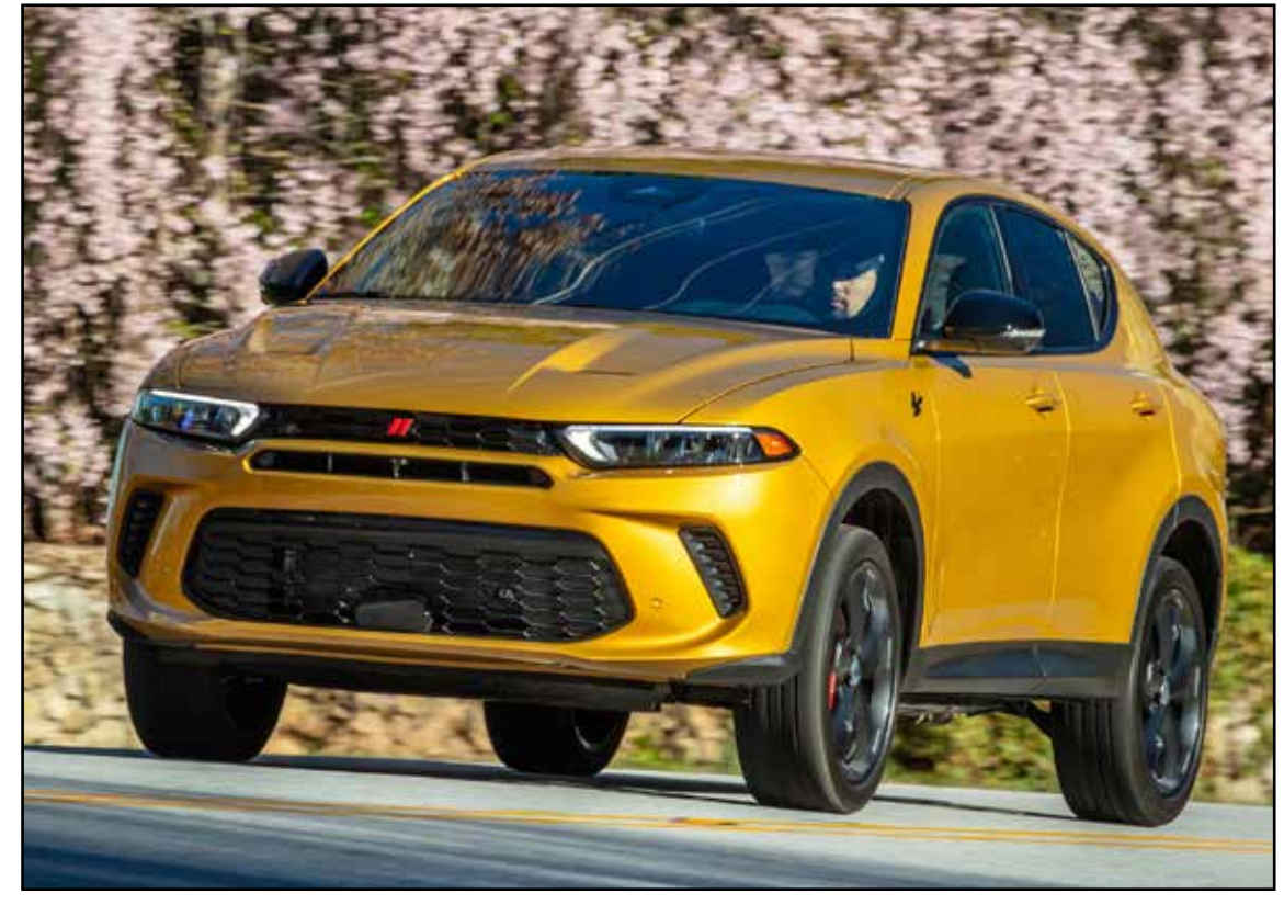
With a starting price under $30,000, the 2023 Dodge Hornet comes with a powerful turbocharged engine and styling elements inspired by classic muscle cars.

Yes, you heard that right. The Hornet emerges from