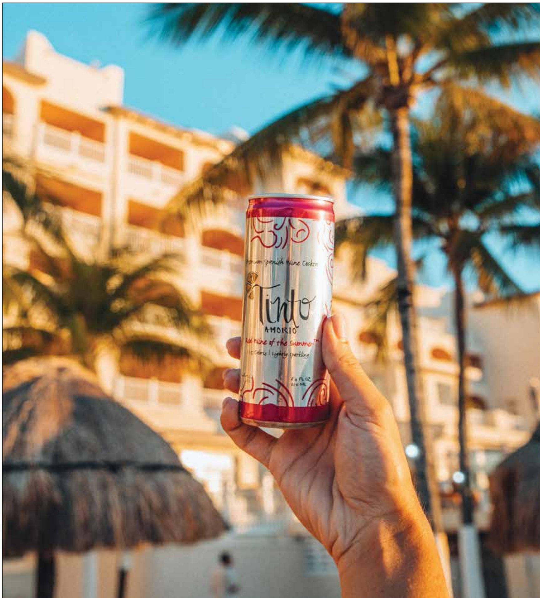
© JULIANNA VEZZA & EVAN DESCHENES

Refreshing with a boozy kick, these guys are going to be everywhere this summer.