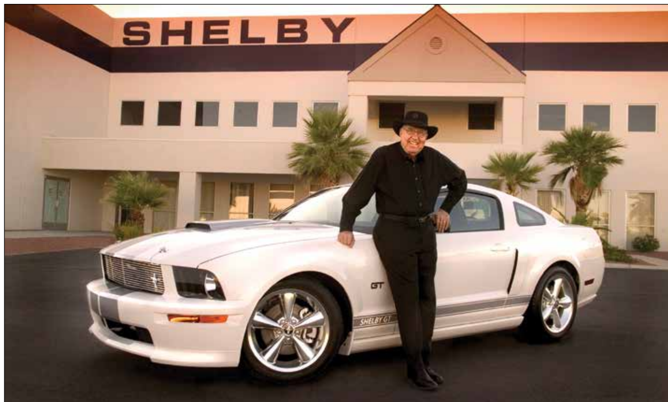
Carroll Shelby stands with the 2007 Ford Shelby GT Mustang.

Shelby had a brilliant idea. He knew from his driving experience that lightweight, nimble British sports cars were quick around a race-track, but they could be even