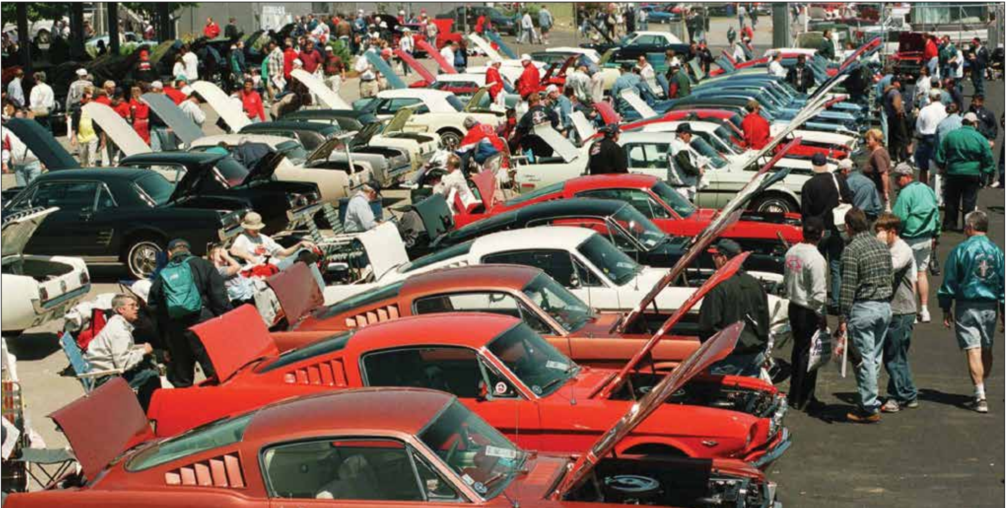
Thousands of Ford Mustang fans — and nearly 6,000 classic Mustangs — gathered at Charlotte Motor Speedway in North Carolina in 1999 to salute the 35th birthday of the American icon.

W hen you buy a Ford Mustang, you're not just buying a car. You're buying access to an exclusive club of car owners who are just as passionate about their Mustang as you are.