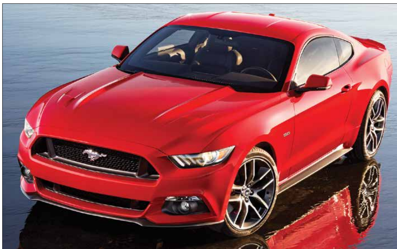
The Mustang's design is completely new for 2015, marking a fresh generation of this iconic American car.

The Mustang's old-school rear suspension design has finally been dumped in favor