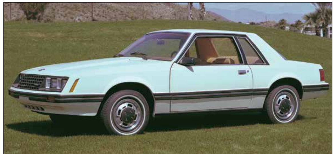
GENERATION 3 1979-1993