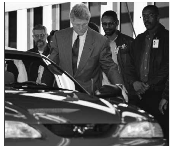
President Clinton checks out a 1994 Ford Mustang.

Ford had resurrected the original Mustang in a modern form, and it would go on to become a sales success once again. Today's Mustang remains popular in large part because of this return to its original roots.