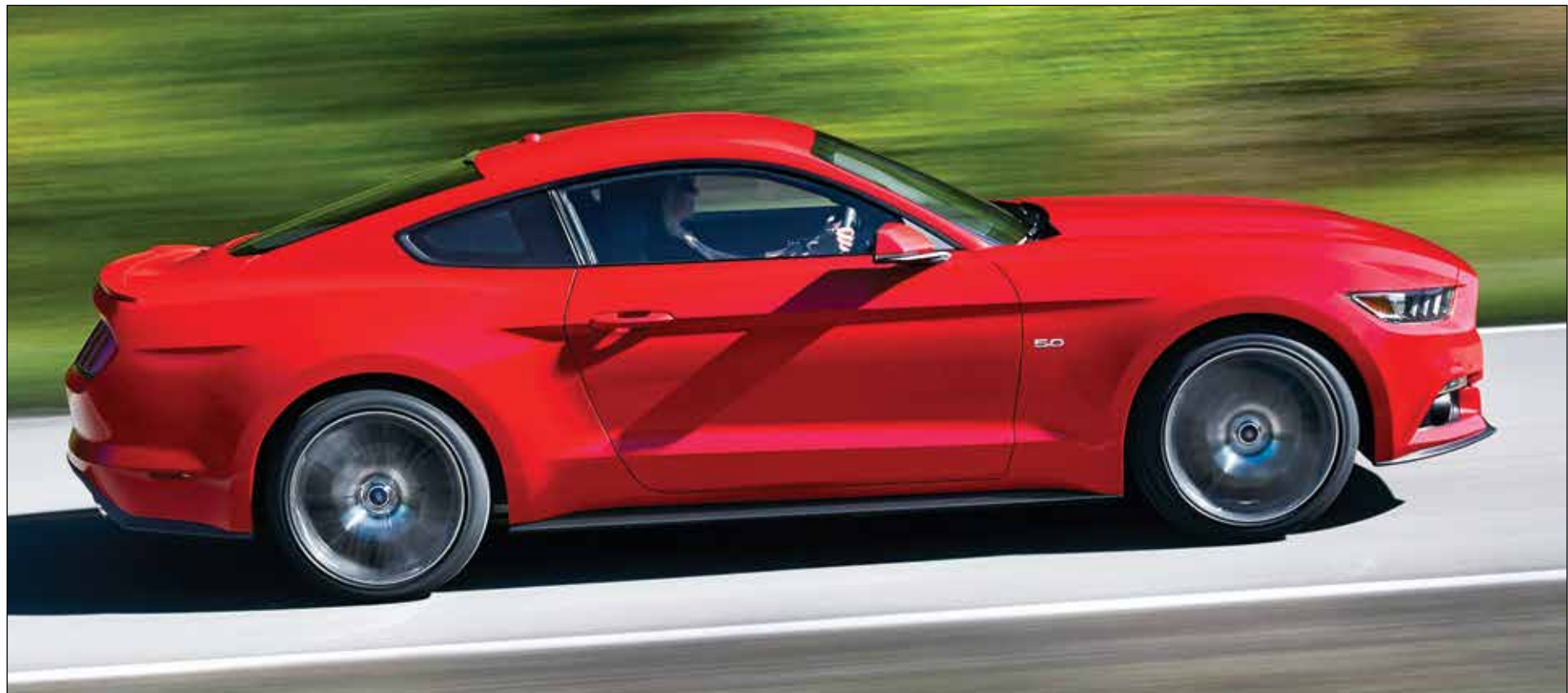
A three-engine lineup, including an EcoBoost turbocharged four-cylinder, adds to the 2015 Mustang's appeal.

The biggest news under the Mustang's hood, though, is the addition of a turbocharged four-cylinder EcoBoost engine to the lineup. This 2.3-liter engine is estimated to produce