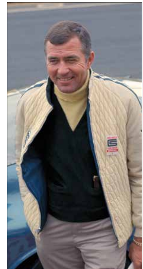
Carroll Shelby played a major role in Ford’s successful racing programs of the 1960s. He is shown here at the 24 Hours of LeMans in France in 1965.

Today you can buy a Shelby GT500 that carries on his dream of a quick, powerful monster of a car. It tops the Mustang lineup with a price around $55,000, but it also offers more speed per dollar than just about any other car on the market.