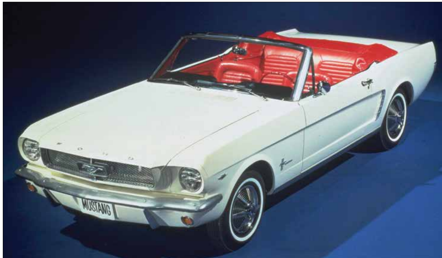
GENERATION 1 1964-1973

The Ford Mustang has seen a lot of changes in its half-century of existence. Here's a look at each model's styling when it was introduced for a new generation.