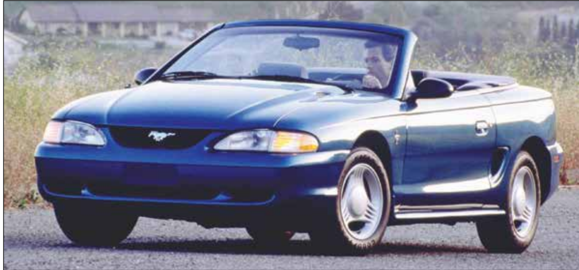
GENERATION 4 1994-2004