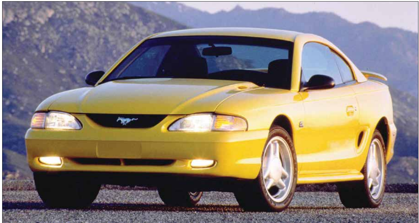
A Ford Mustang GT from 1994 shows how the Mustang returned to its muscle-car roots.

By the late 1980s, Ford had all but abandoned the original Mustang's formula. Engineers were working on a