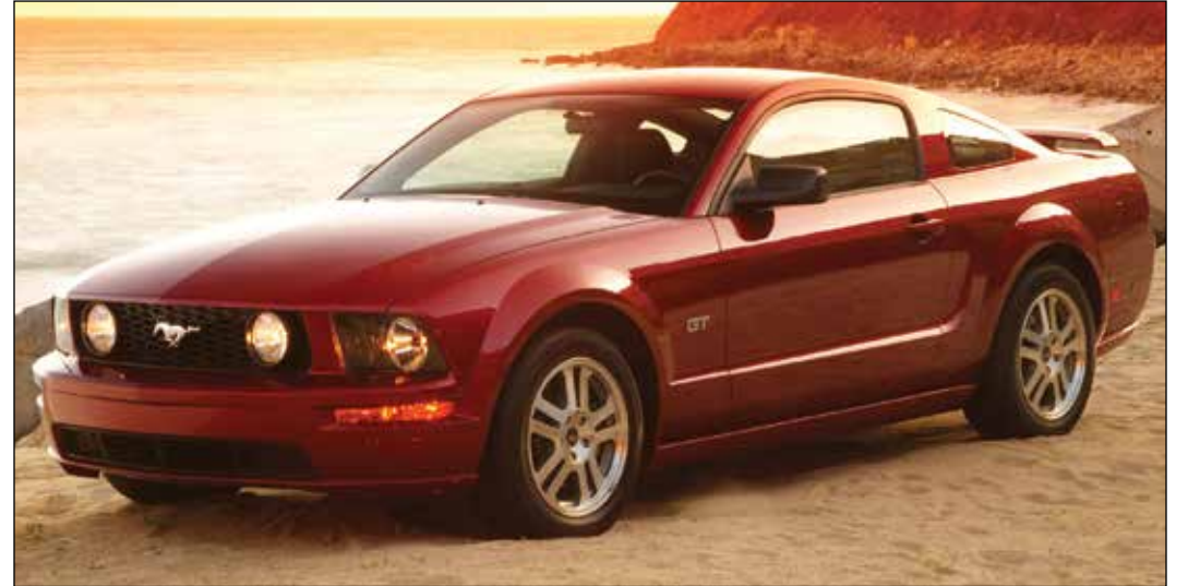
GENERATION 5 2005-2014