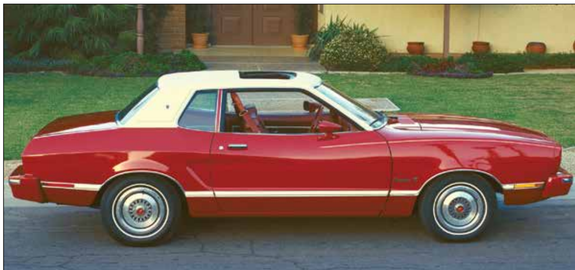
GENERATION 2 1974-1978