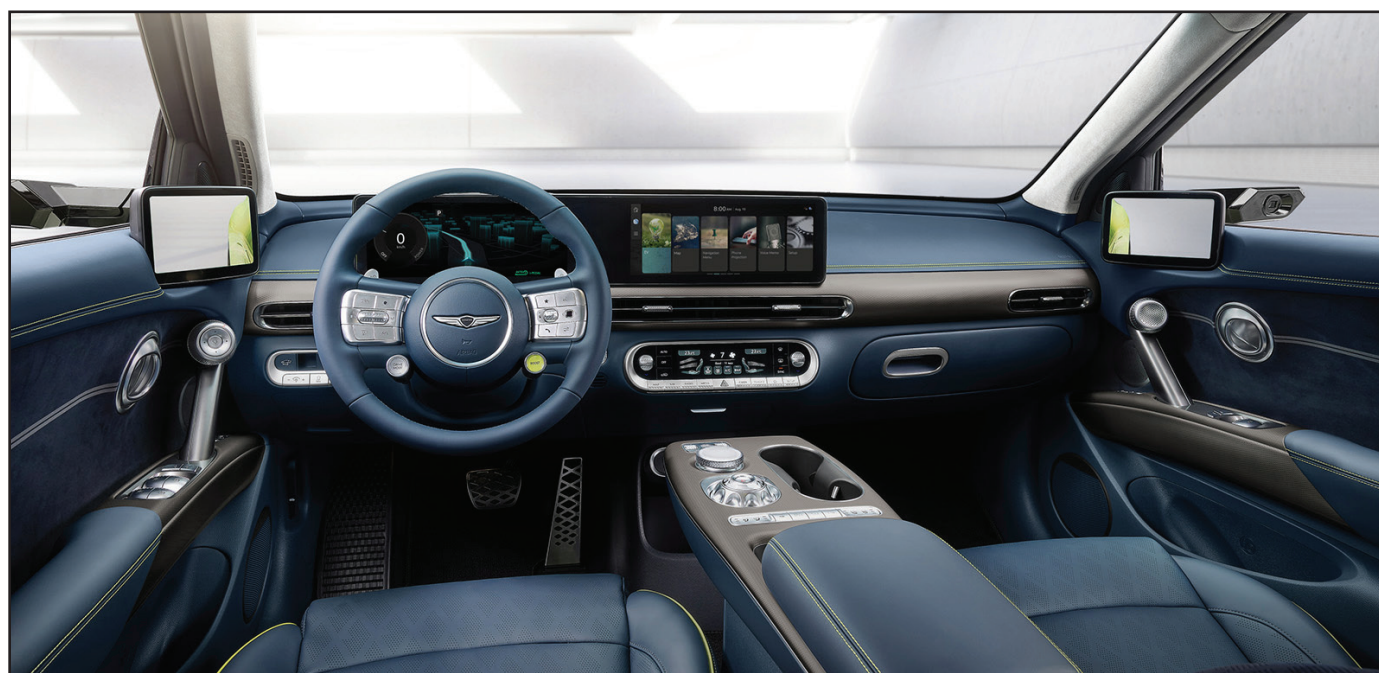
The GV60 can be started without a key using biometric scans. A facial recognition camera on the door and fingerprint scanner on the center console can identify the owner.

When you sit down, a crystal orb glows on the center console. It rolls