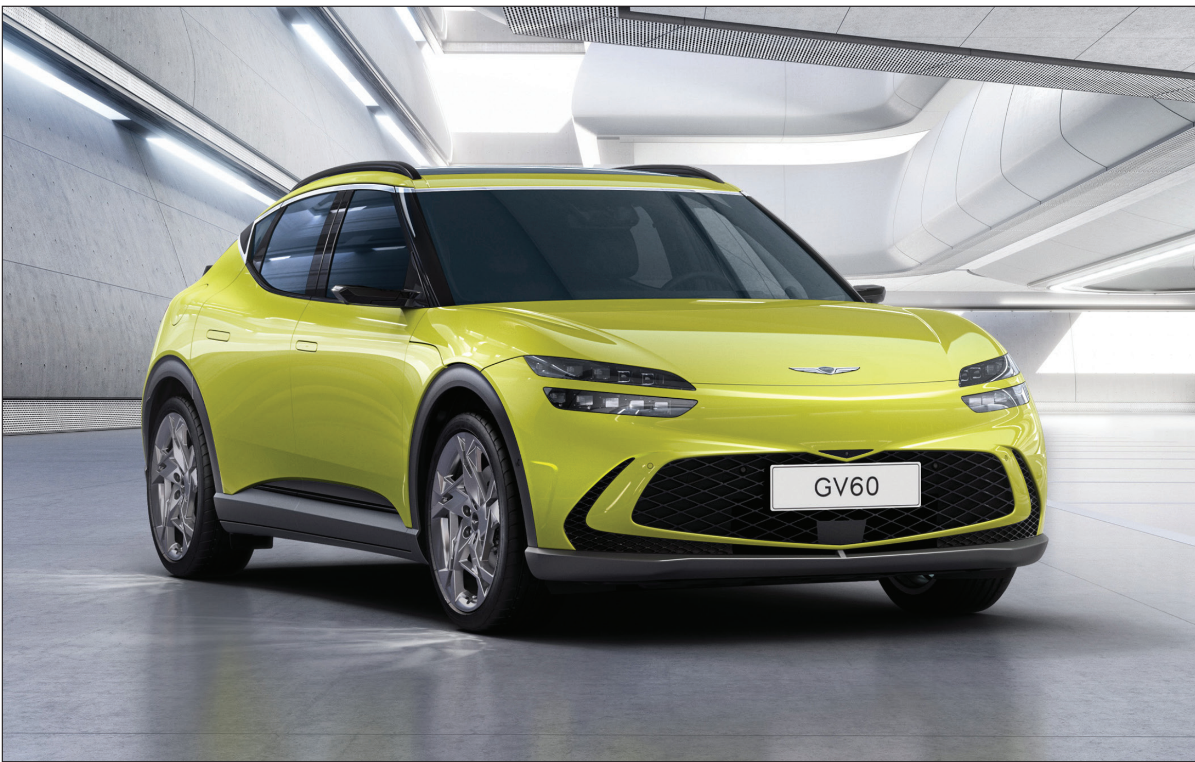
The Genesis GV60 shows what a relatively young luxury brand can do with an all-electric design. It has up to 248 miles of range and a futuristic, theatrical flair.