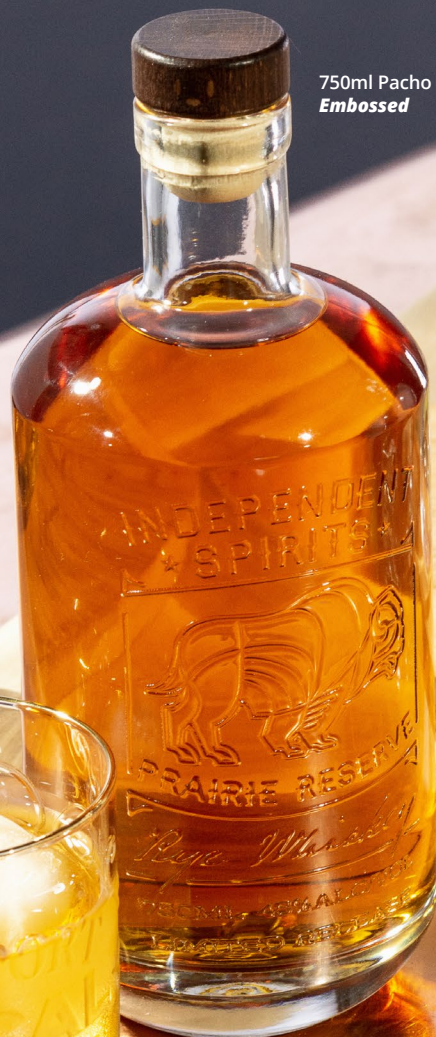
750ml Pacho Bottle Embossed