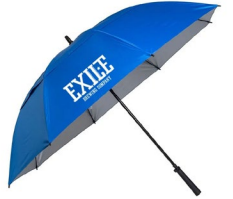
62" The Raydefyer Umbrella 15008UV