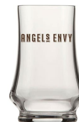
5.75 oz. Grand Whiskey Taster