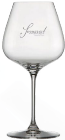
24.85 oz. Grape@Riedel Pinot Noir/Aperitivo Wine 0424/07