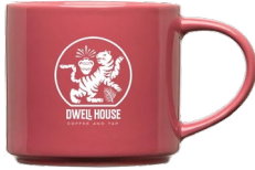
16 oz. Norwich Stacking Mug CR959