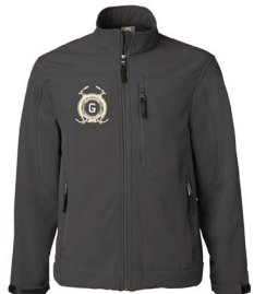
Weatherproof 6500 Soft Shell Jacket