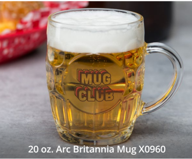
20 oz. Arc Britannia Mug X0960

Mug clubs have long been the cornerstone of bar loyalty—nothing beats a regular raising their own custom tankard at the bar. But what if space is tight or you're ready to evolve beyond the ceiling of steins? It might be time to blend tradition with a few fresh ideas.