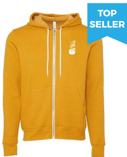
Canvas 3739 Unisex Full Zip Hoodie