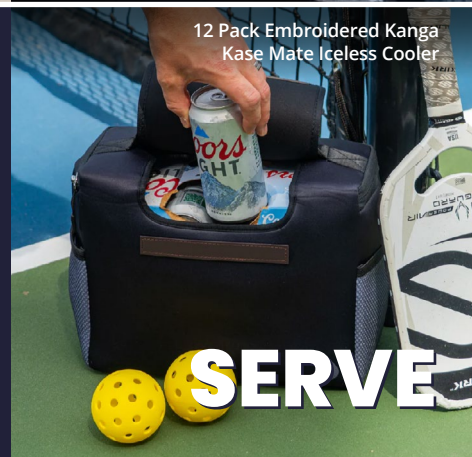
12 Pack Embroidered Kanga Kase Mate Iceless Cooler