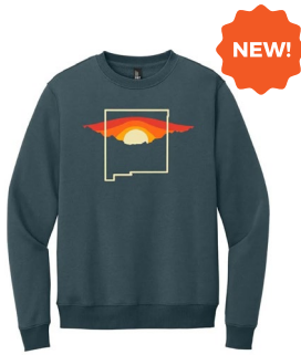
District Perfect Weight Fleece Crew-DT1106