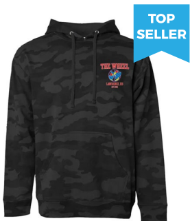
Independent SS4500 Midweight Pullover Hoodie