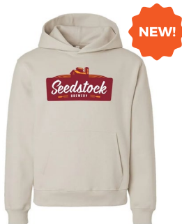
Bella Canvas Unisex 10 oz. Heavyweight Pullover Hoodie 4719