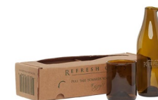
Refresh Glass Nesting Carafe & Glass Set