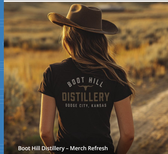
Boot Hill Distillery – Merch Refresh