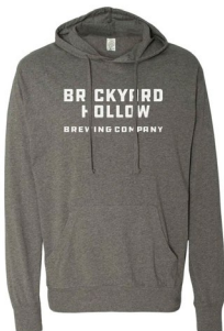
Independent SS150J Lightweight Long Sleeve Pullover