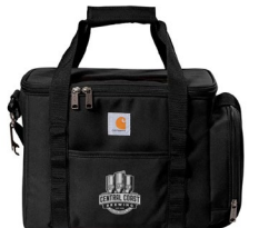
36-Can Carhartt Duffel Cooler