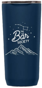
20 oz. CamelBak Insulated Tumbler 2389

Quality. Freshness. Flavor. Whether you're selling coffee in-house or offering cold brew bottles to-go, Grandstand has all the products your coffee shop needs to highlight your brew. You put a lot of time and thought into developing your flavor profile – Do justice to the brand you created by showcasing it with quality printed products.