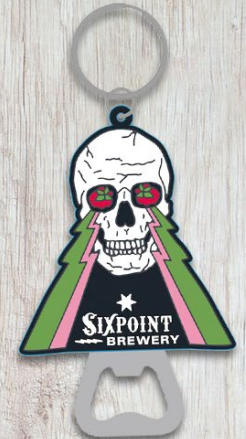
Custom PVC Bottle Opener w/ Key Ring

Keep your brand close at hand—literally. Heavy-duty, engraved keychains add a sense of craftsmanship and permanence that lighter giveaways can't match. Whether clipped to a taproom key or gifted as part of a welcome kit, they're a subtle but powerful daily brand touchpoint that customers carry everywhere.