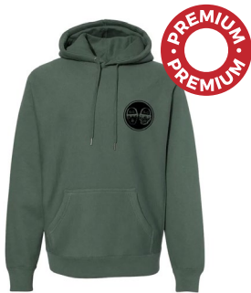
Independent IND5000P Legend Premium Heavyweight Cross-Grain Hoodie