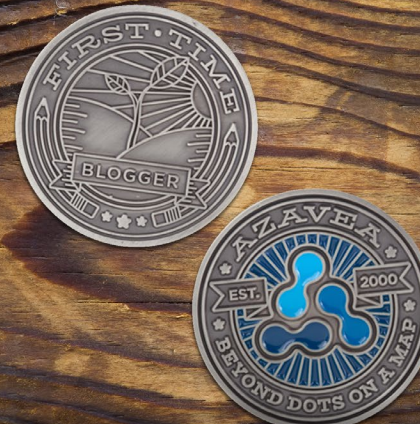
2" Zinc Challenge Coin 4 Color/Die Struck

Bring a sense of tradition and camaraderie to your mug club with custom challenge coins. These collectible pieces can be traded, displayed, or used in fun "challenge" games among members—turning your club into a true community. Each coin becomes a symbol of pride, connection, and shared story within your brand's culture.