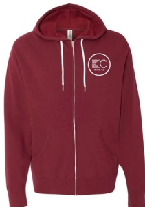
Independent AFX90UNZ Full Zip Hoodie