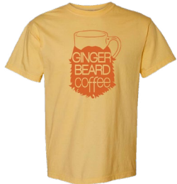
Comfort Colors 1717 Pigment Dyed Tee