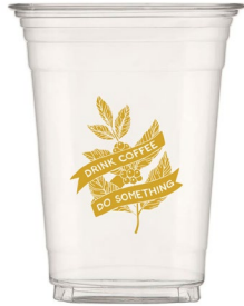
16 oz. Recyclable PET Single-Use Cup