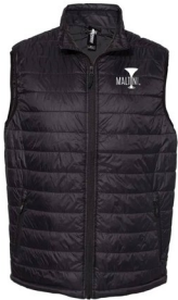
Independent Trading Co. EXP120PFV Puffer Vest