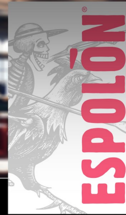
Decklite Custom 8" x 8" x 15" LED Bottle Glorifier

Bring your brand to life in retail spaces with custom POP and POS solutions designed to stand out. From tailored shelf talkers, flags, LED signs, and tackers to complete case stackers, base wraps, sale stands, and pole toppers—every element is crafted to reflect your brand identity and campaign goals. Enjoy vivid, durable graphics printed with premium quality on versatile materials ranging from sleek metal to lightweight foam board and illuminated LED. With streamlined production and expert in-house artists, we deliver fast turnaround times without compromising quality. Create cohesive, eye-catching displays that enhance visibility, drive engagement, and boost sell-through where it matters most.