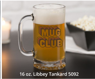
16 oz. Libbey Tankard 5092