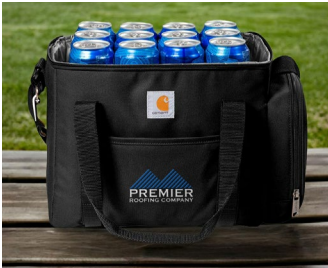
Charcuterie Boards, Decanter Sets, Carhartt Cooler Bags