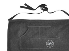
Artisan Collection RP125 4-Pocket Waist Apron