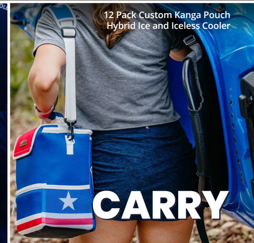
12 Pack Custom Kanga Pouch Hybrid Ice and Iceless Cooler