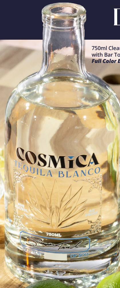
750ml Clear Nordic Bottle with Bar Top Finish Full Color Embossed