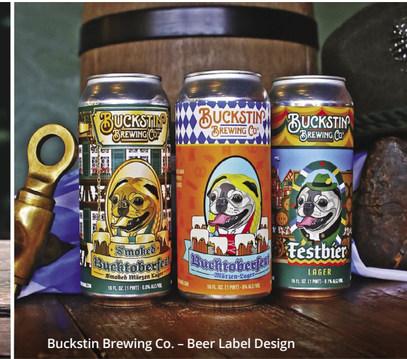
Buckstin Brewing Co. – Beer Label Design