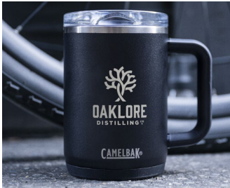
CamelBak, Fifty/Fifty, Stanley, Brûmate