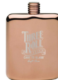
6 oz. Copper Plated Sleekline Pocket Flask