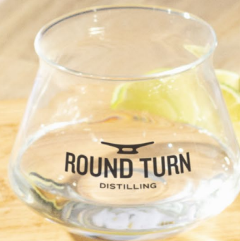
6.5 oz. Rastal Teku Taster