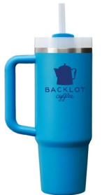
30 oz. Stanley Drinkware Quencher H2.O Flowstate Tumbler