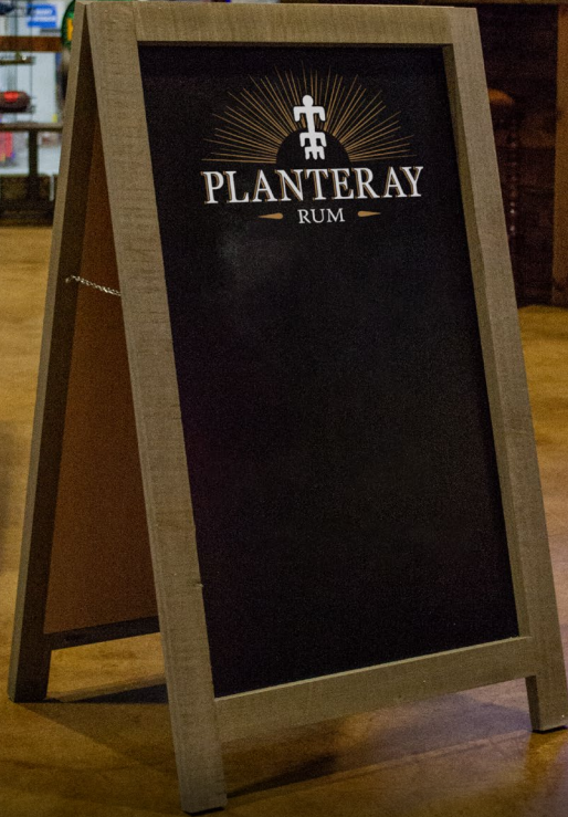
Sustainable Wood A-Frame Sidewalk Chalkboard

Bring your brand to life in retail spaces with custom POP and POS solutions designed to stand out. From tailored shelf talkers, flags, LED signs, and tackers to complete case stackers, base wraps, sale stands, and pole toppers—every element is crafted to reflect your brand identity and campaign goals. Enjoy vivid, durable graphics printed with premium quality on versatile materials ranging from sleek metal to lightweight foam board and illuminated LED. With streamlined production and expert in-house artists, we deliver fast turnaround times without compromising quality. Create cohesive, eye-catching displays that enhance visibility, drive engagement, and boost sell-through where it matters most.