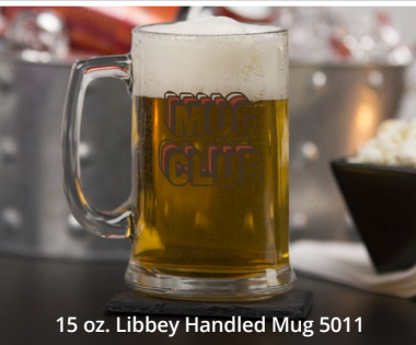
15 oz. Libbey Handled Mug 5011