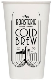
16 oz. Paper Cup-T- PC16