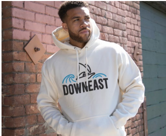
AS Colour, Bella + Canvas, Gildan, Independent Trading Co.