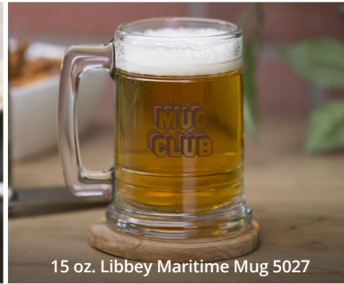
15 oz. Libbey Maritime Mug 5027