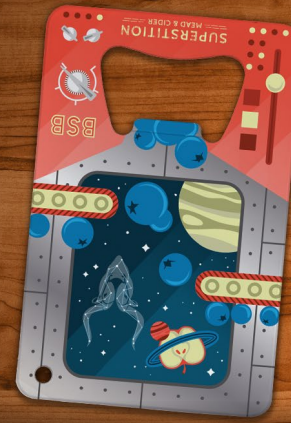
Full Color Credit Card Bottle Opener

Elevate your loyalty program with durable, credit card-style membership passes that do more than just sit in a wallet. Turn them into functional bottle openers or scannable access passes for exclusive events, discounts, or early releases. It's a sleek way to give your members a sense of belonging—and a tangible reminder of their VIP status.