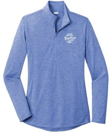
Sport Tek LST407 Ladies' Tri-Blend Wicking 1/4-Zip Pullover