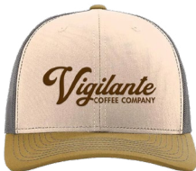
Richardson 112 Mesh Back Snapback Cap