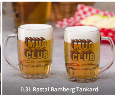
0.3L Rastal Bamberg Tankard