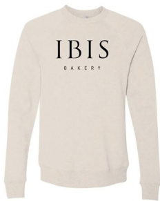
Canvas 3901 Unisex Sponge Fleece Crew Neck