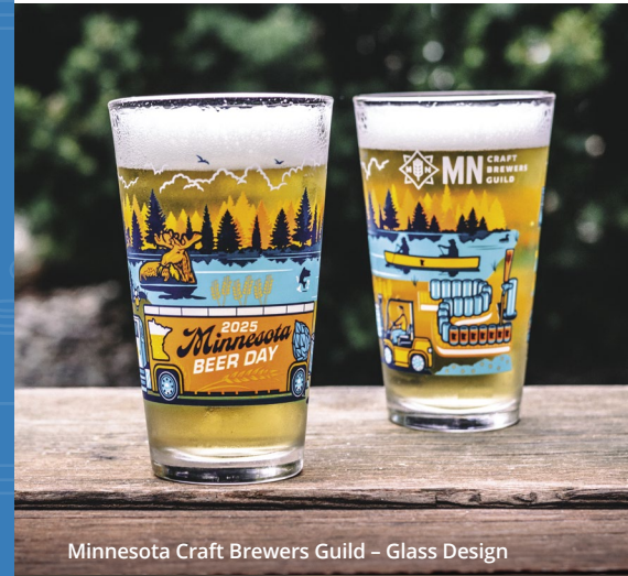
Minnesota Craft Brewers Guild – Glass Design