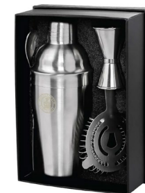
Bartender's Mixology Cocktail Shaker Bar Set