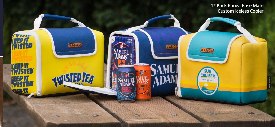
12 Pack Kanga Kase Mate Custom Iceless Cooler