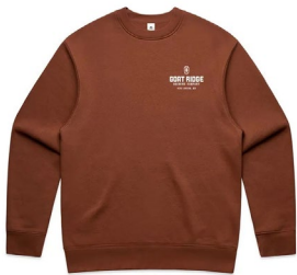
AS Colour 5160/5165 Mens Relax Crew