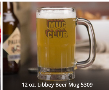
12 oz. Libbey Beer Mug 5309