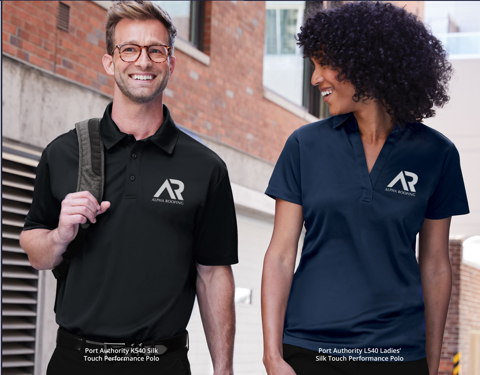
Port Authority K540 Silk Touch Performance Polo